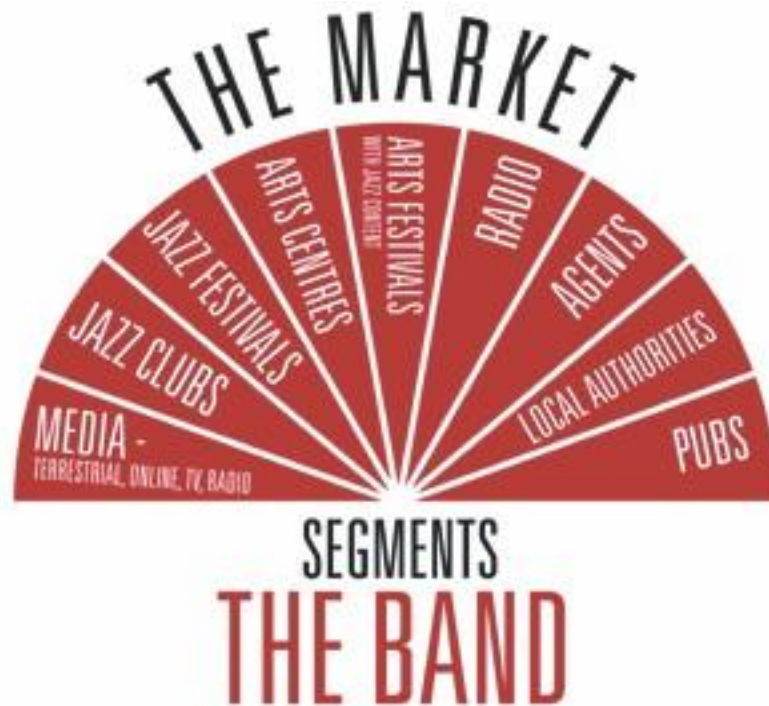
Figure 3: Market Segments

The overall market for jazz can therefore be divided into distinct units or groups of customers.