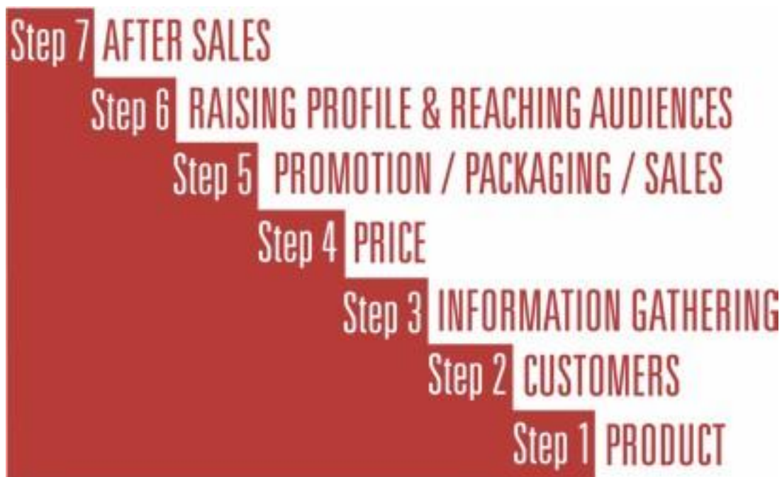
Figure 2: the 7 steps of marketing