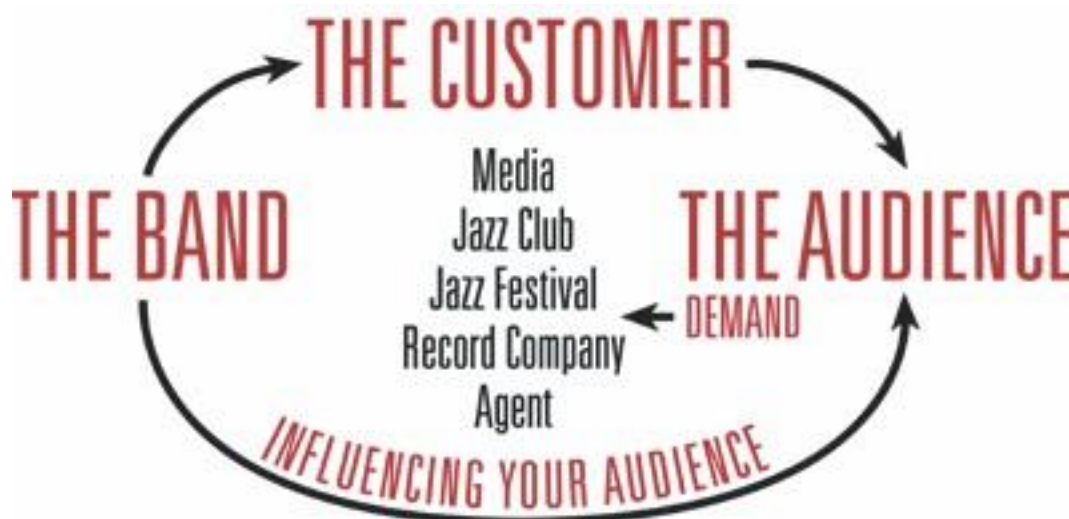
Figure 1: Marketing Relationships

You, the jazz musician have to package your music, fix a price and then promote it to the customer. The music being marketed will range across the full spectrum of jazz from New Orleans to free improvised and all points in between. For simplicity’s sake we are going to call this music the ‘product’. Some may object, but let us not forget we are marketing jazz which is the ‘product’ of a unique creative process.